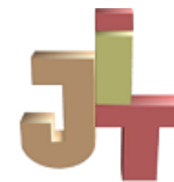
Stiftsgymnasium St. Paul, St. Paul in Lavanttal