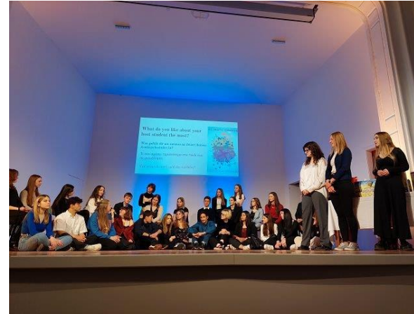
Cross student exchange in St. Paul. Meeting new friends and cultures